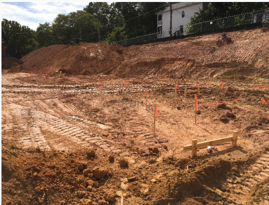
Survey Layout and Footing Excavation