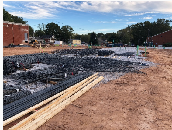
Retaining wall foundation and rebar