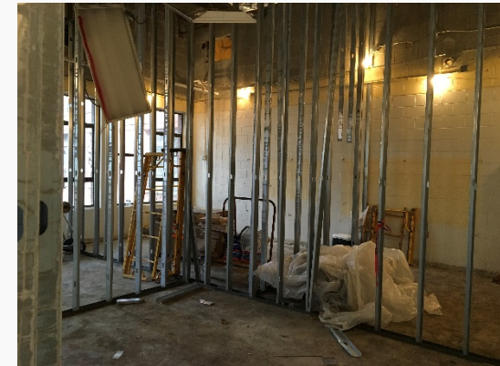
Renovation Framing and MEP Rough